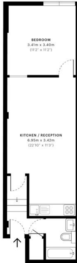
— First Floor